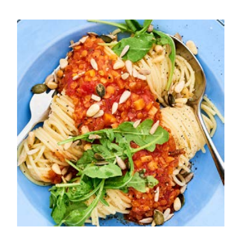
Spagetti bolognese with lentils

★ Ett löv Ett löv innebär att beroende på hur du äter idag och i övrigt kan detta recept vara ett steg i rätt riktning. Motavarar ett utskipp av CO2-e på mer än 1.4 men max 2.4